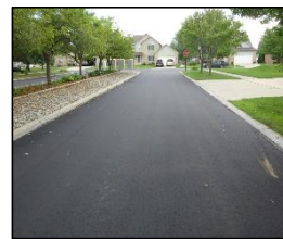
2015 Photos of the milled roadways with detail 7 joint repairs and scratch course The FiberMat® consisted of

0.25 lbs./sy of fiberglass, 0.40 gal./sy of FiberMat® emulsion and 22lbs/sy of aggregate over the entire repaired roadway.